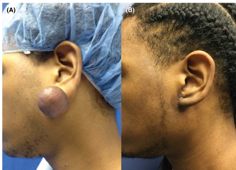
Figure 1. Typical clinical appearance of before keloid scar removal (A) and after following keloid treatment protocol (B).

A total of 49 patients and 50 keloids were treated with the described protocol from November 2013 to November 2015 at the authors' private practice office. All patients were African American, except 5 who self-reported as Latino; there were 35 female (71%) and 14 male (28%), aged 15 to 66 with a median age of 33 years; Table 1 outlines patient characteristics. Keloids