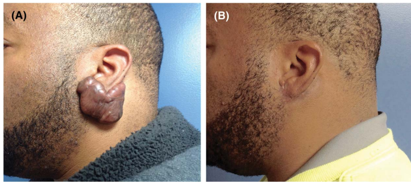
Figure 2. African American male with keloid scar on the right outer ear lobule that occurred after piercing (A) and follow-up 6 months after keloid treatment protocol (B).

were localized to the ear, with 13 (27%) confined to the lobule and measured an average of 2 \times 3 cm. The treatment was well tolerated by all patients with no known or limited adverse reactions (e.g., hypertrophy/hyperpigmentation/wound dehiscence) reported after procedure and on follow-up. Patients were seen in-office for follow-up; however, in certain cases in which patients were unable to return for face-to-face follow-up, the authors had a nurse practitioner contact them by phone to confirm success of keloid treatment and requested photo documentation. Figures 1–3 illustrate before and after outcomes.